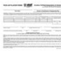
SAMPLE FORM D