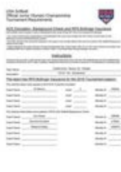
SAMPLE FORM C