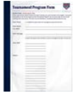
SAMPLE FORM E