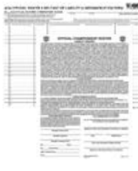
SAMPLE FORM B