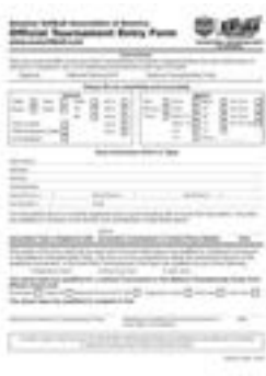
SAMPLE FORM A

The required forms for the tournament can be printed directly through your team's RegisterUSA account and will be pre-populated with the information from your team. Please contact your league/team administrator for copies.