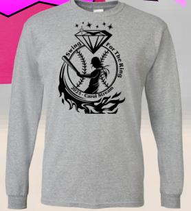
Long Sleeve Tee